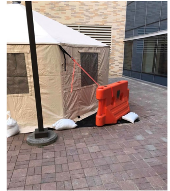
Non-critical patient tent